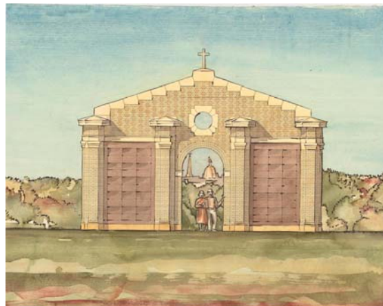
Mausoleum: North/South Elevation