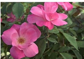
Knockout Shrub Roses