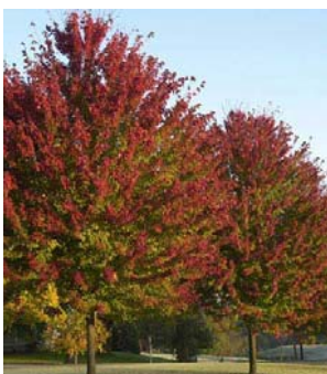
Autumn Blaze Maple