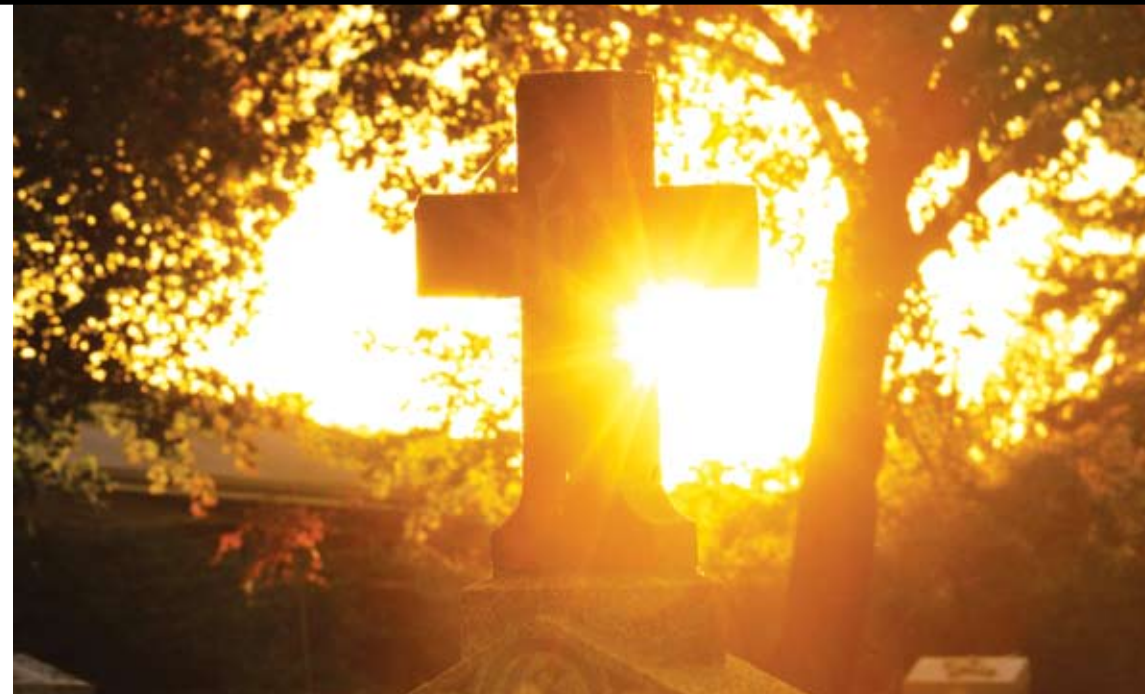
Sunset at historic Cedar Grove Cemetery.

Purchases of above-ground burial space in Our Lady of Sorrows at Cedar Grove Cemetery may be made in person at the cemetery or over the telephone. The cemetery website ( cemetery.nd.edu ) includes a virtual tour, giving you the sense of being on-site when you cannot be. Cemetery counselors offer you their knowledge to make an educated burial selection. They are available Monday through Friday for personal counseling sessions. Counseling sessions are scheduled in one-hour increments and must