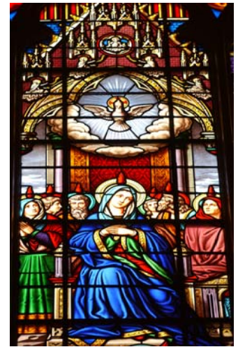
STAINED GLASS WINDOW, BASILICA OF THE SACRED HEART

The following topics take you through the natural order of events following a death, including the people to contact and the decisions to be made. Space is provided for you to record your wishes.