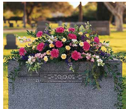
TRADITIONAL UPRIGHT MONUMENT

Many cemeteries offer additional services such as annual plantings or the placement of a wreath during the Christmas holiday for those families who live far away or are unable to do so themselves. Flowers may be ordered from a local florist for placement at or on the monument to mark an anniversary, birthday, etc. Be sure to understand your cemetery’s rules and regulations before ordering.