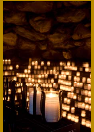
INSIDE THE GROTTTO