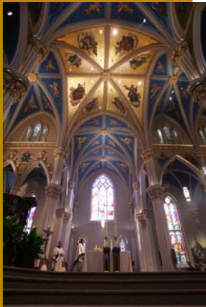
BASILICA OF THE SACRED HEART