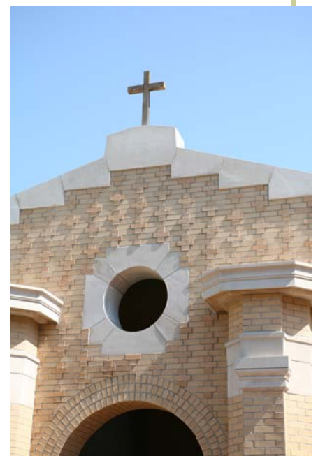
OUR LADY OF SORROWS AT CEDAR GROVE CEMETERY MAUSOLEA

Companions may be side-by-side, tandem (front to back, head to toe) or couch (front to back, length-wise).