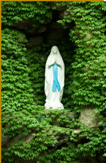
STATUE OF THE BLESSED VIRGIN MARY, GROTTA