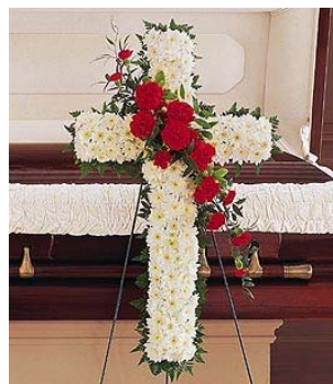
FLOWER CROSS ON EASEL