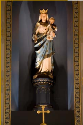
MADONNA AND CHILD STATUE, BASILICA OF THE SACRED HEART

The Order of Christian Funerals notes that the role and place of music is “integral to the funeral rites.” Hymns and songs that help express our Christian hope, provide consolation for those who mourn, and help direct us to the Paschal Mystery of