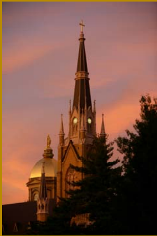
BASILICA OF THE SACRED HEART AND GOLDEN DOME

ORGANIZING ITEMS, RECORDING FAMILY NAMES, HOBBIES AND KEY ACCOMPLISHMENTS ELIMINATES UNCERTAINTY FOR YOUR LOVED ONES.