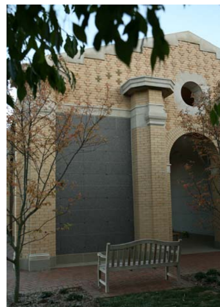
NICHE SHUTTERS ON THE EXTERIOR OF OUR LADY OF SORROWS AT CEDAR GROVE CEMETERY MAUSOLEA