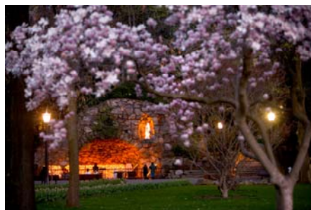
GROTTO, UNIVERSITY OF NOTRE DAME

As Catholics, we believe that what happened to Jesus in His resurrection from the dead will also one day happen to us. This hope in life after death has brought joy and comfort to millions of believers as they mourn the death and