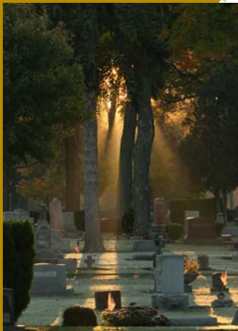
HISTORIC CEDAR GROVE CEMETERY